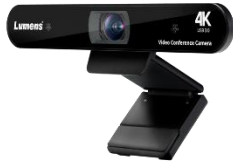
VC-B11U 4K USB Conference Camera