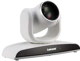
VC-B30U Full HD USB PTZ Camera