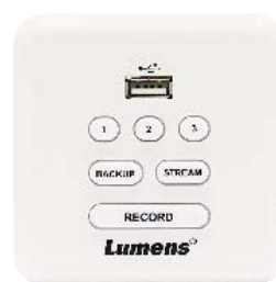
Europe standard: LC-RC01E