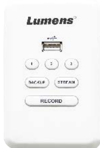
U.S. standard: LC-RC01U

Lumens LC-RC01 remote control panel, a wall plate for the LC200 to control the live streaming, recording, and video file saving options. The panel provides three macro functions that can remotely switch the scene and control the cameras preset. The LC-RC01 can be extended to 30 meters through a Cat 5e cable. It can be mounted on walls and furniture in any standard one-gang US/EU A/V frame enclosure. Equipped with a USB port, it supports USB flash drives to record or backup video files. The LC-RC01 offers greater flexibility for operating the LC200.