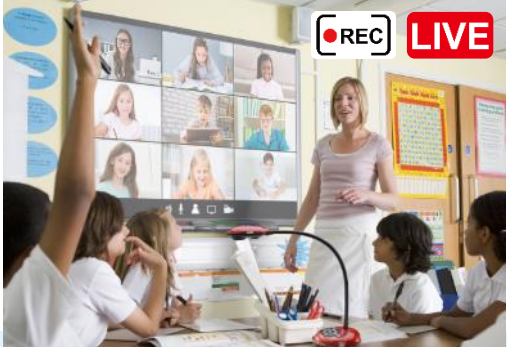
#3 Recording & Live Streaming

Stream your lectures, campus events, graduations or other ceremonies on various streaming platforms.