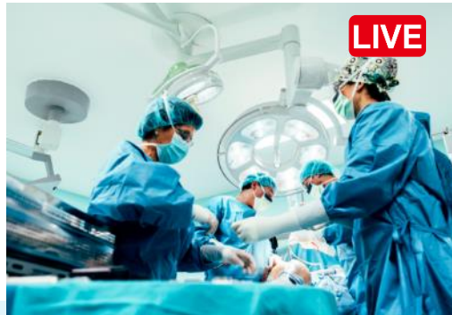
#2 Live Streaming

Record Surgical process. Medical students can learn and practice from their own side.