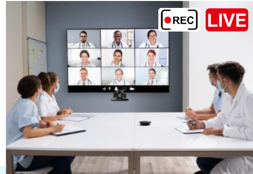
#3 Recording & Live Streaming

Live surgical solutions provide real-time monitoring of surgical progress for remote doctors or trainee teaching.