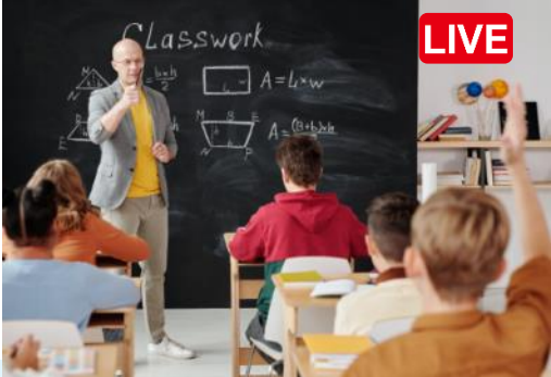
#2 Live Streaming

Record lecture allows students to review the captured course 24/7 online.