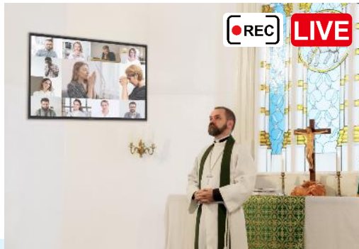
#3 Recording & Live Streaming

Provide online sermons and classes. People who cannot attend services in person can still feel involved. Extend the reach among worshippers.