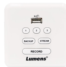
Europe standard: LC-RC01E