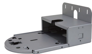
VC-AC08 Wall Mount